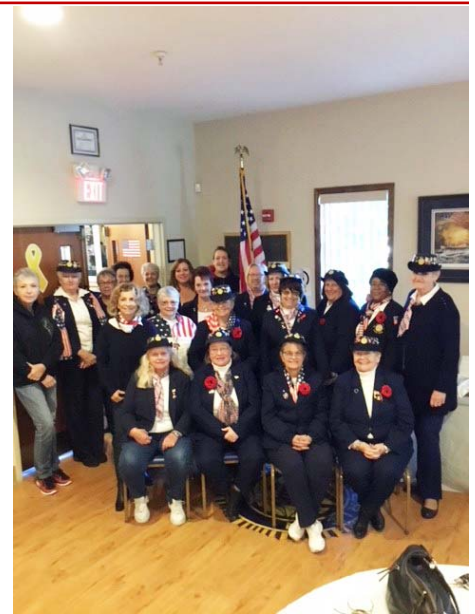
Auxiliary members attending Veterans Day ceremonies at Post 129.